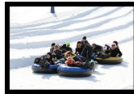
Family Snow Tubing at Whitetail Ridge Ski Area Fort McCoy

What a wonderful time of the year to be part of the North Church family and celebrate the birth and gift of our Savior together!